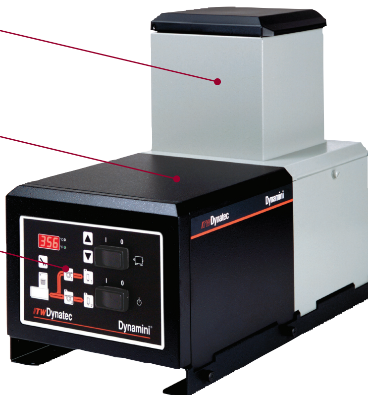
Dynamini™ Series Models: N05 & N10

Icon-driven control panel simplifies operations.