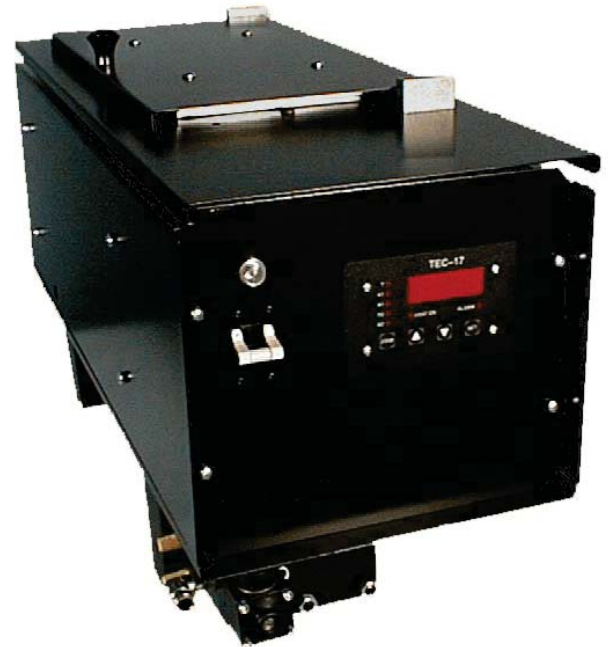
TEC-17 Adhesive Supply Unit